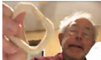
... and removes it!