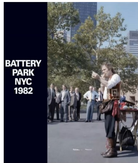
New Orleans and New York