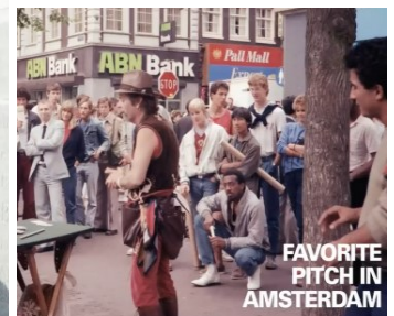
And internationally—England, The Netherlands