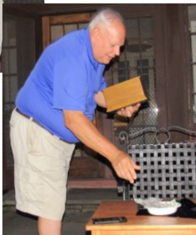
...and displayed a box (well, it’s not really a box) that he repeatedly showed empty, but produced a seemingly endless supply of money.