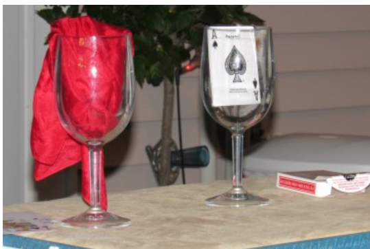
Bob's controlled chaos from order.