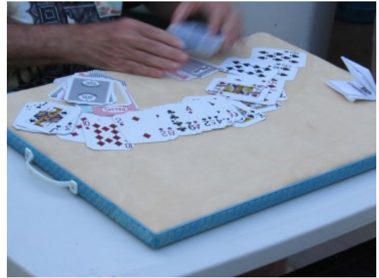
Dan's card spread.

A school is diagonally across the street and would be an alternative parking spot.