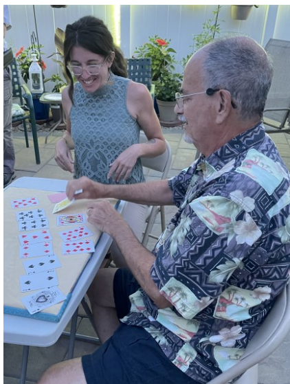
The predictions prove to be true.