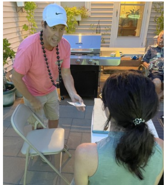
Norm's Five-Though-One bills.