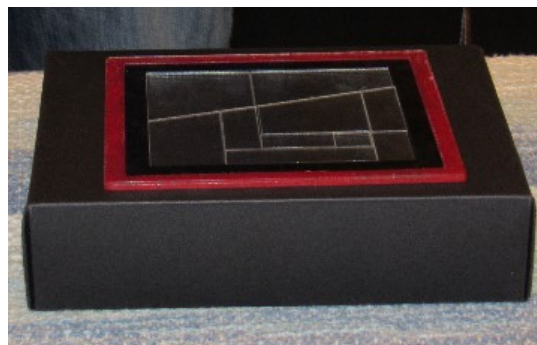
The pieces of his piece.