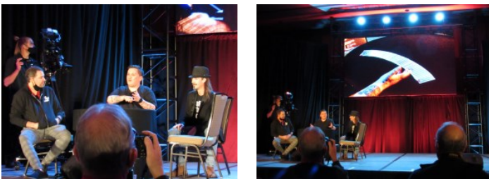
The guys from “all thing magic” give a talk on their tricks. The camera crew made sure we could see everything.