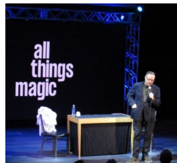
At a venue at the other end of Fremont Street, the "all things magic" group presents a fantastic close-up show.