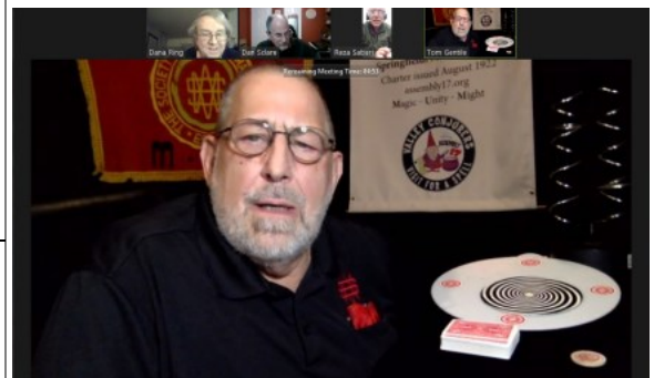
A select few tuned in for January's meeting.

One tap mobile +16465588656,,87641524045# US (New York) +13126266799,,87641524045# US (Chicago) Dial by your location +1 646 558 8656 US (New York) +1 312 626 6799 US (Chicago) +1 301 715 8592 US (Washington DC) +1 669 900 6833 US (San Jose) +1 253 215 8782 US (Tacoma) +1 346 248 7799 US (Houston)