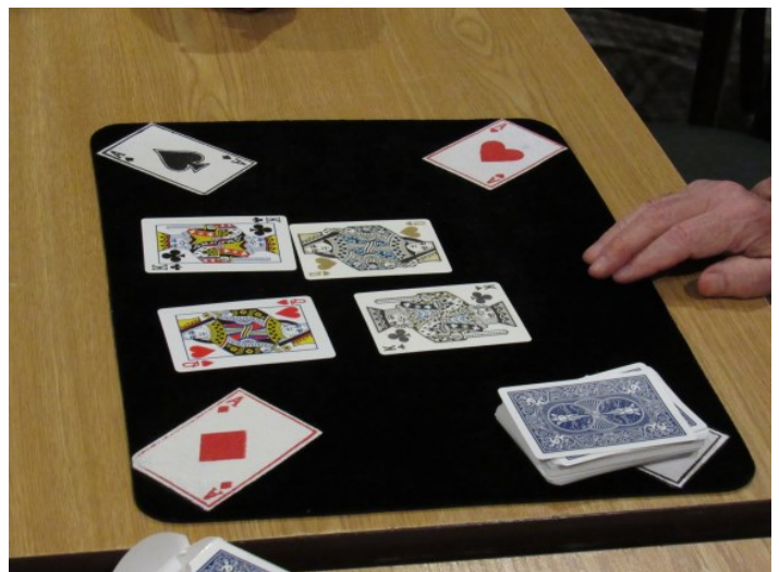
The card matches the neighbors.