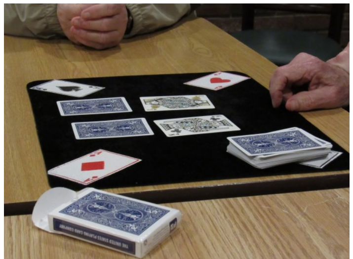
The card is split apart, placed with its neighbors.