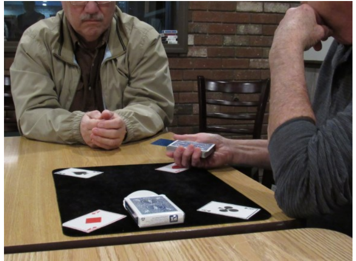
A special card inserted into the deck.