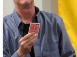
With simple twists, the holes punched in the card move all around.