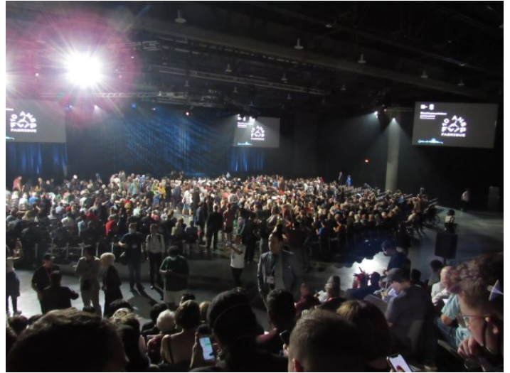
We weren't allow to take photos during the performances, but this is a shot from the bleachers of the Stage contests.