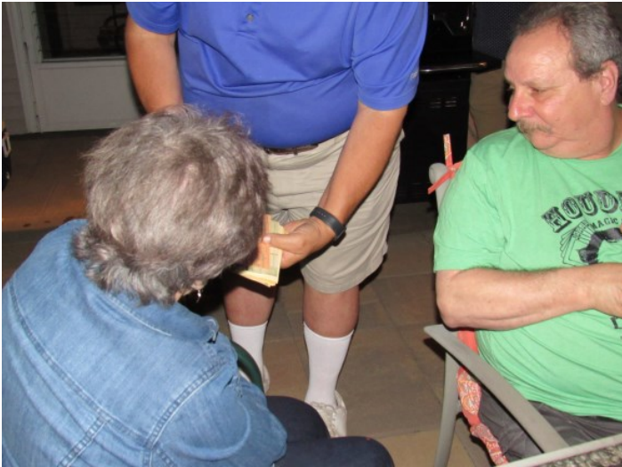
Choosing a ticket.