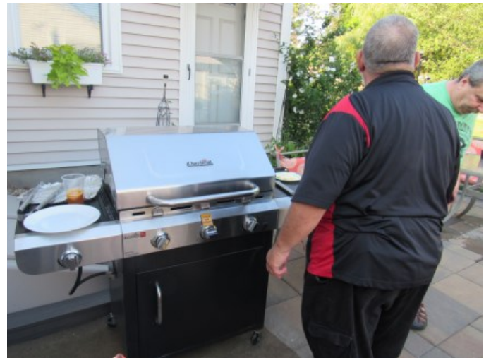
The master griller.