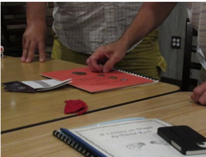
Norm's coin trick.