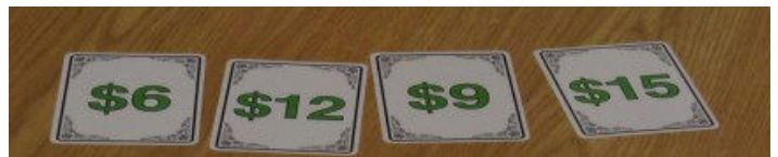
The price of the selected items comes to $42...