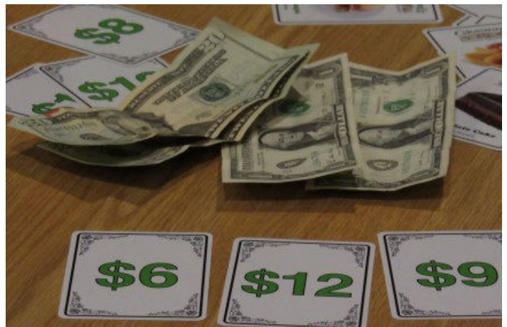
...the exact amount of cash in the box!