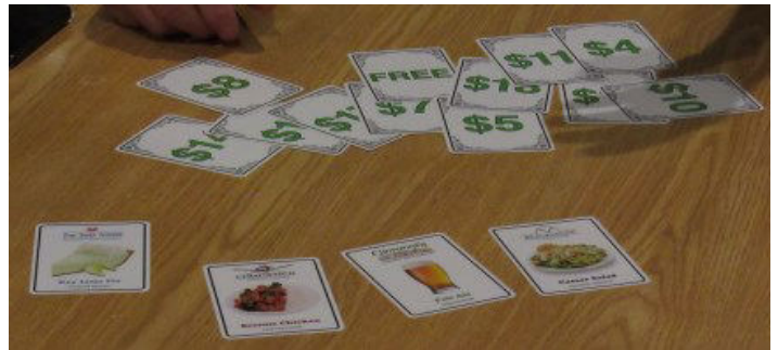
Four items are selected. The other cards are turned over, showing the prices of the items, all different.