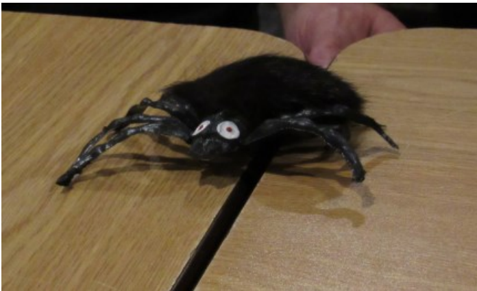
Another treasure found. (It has a squeeze-bulb that makes the spider hop about.)