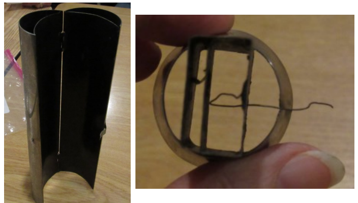
Examining the props from Syd Radner ' son. Some items were obvious (left); others definitely not (right).

Some artistic soda cans. This involves drawing the figures upside-down near the top of the can, then carefully cutting them out and bending them up to "stand" on the can.