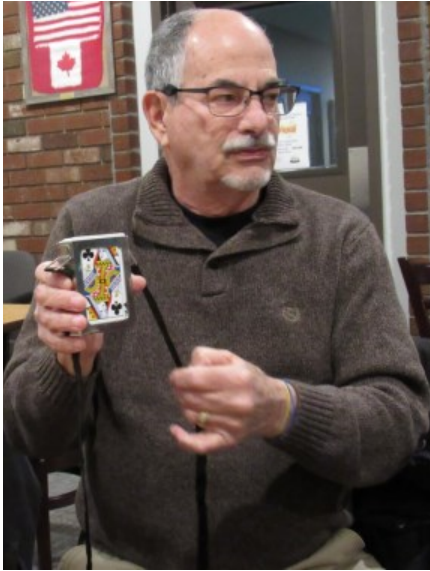
A no-hands card rise. The cards are in a case, and strings are attached through the hooks.