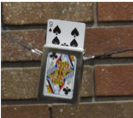
Selected cards rise with no-one touching the case.