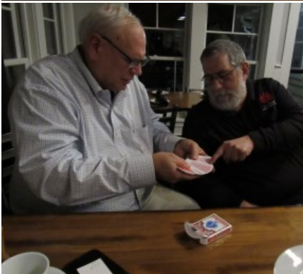
A card is selected— it’s not the Queen, but it now graces the back of the box.