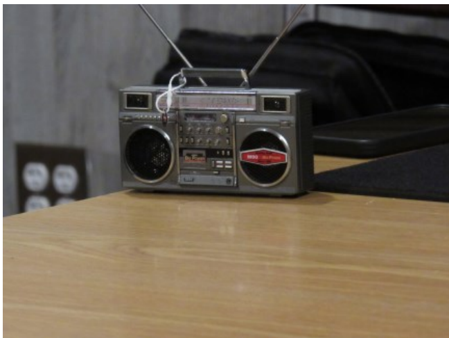
His musical accompaniment.