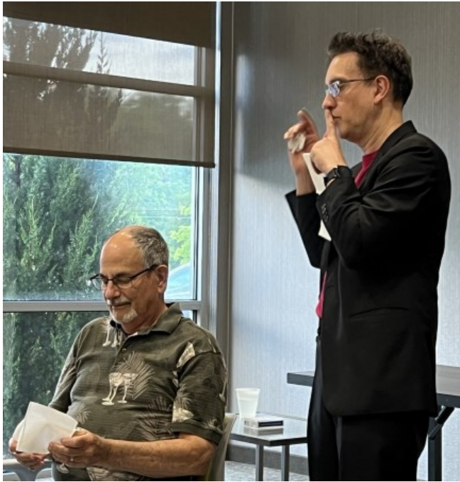
Oooh, a secret!