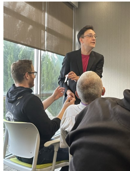
Go ahead, I won't peek!