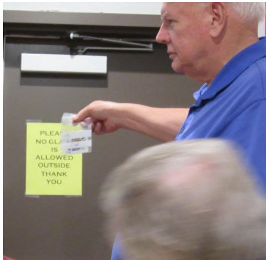
Houdini in a bag.