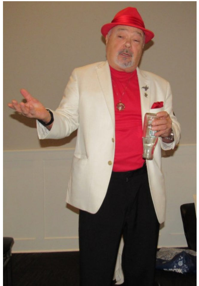
A successful effect, and Happy Holidays to all!