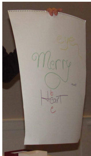
Norm's completed Chart.