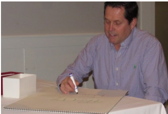
Each answer was written with a different-colored marker.