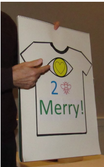
A perfect match!