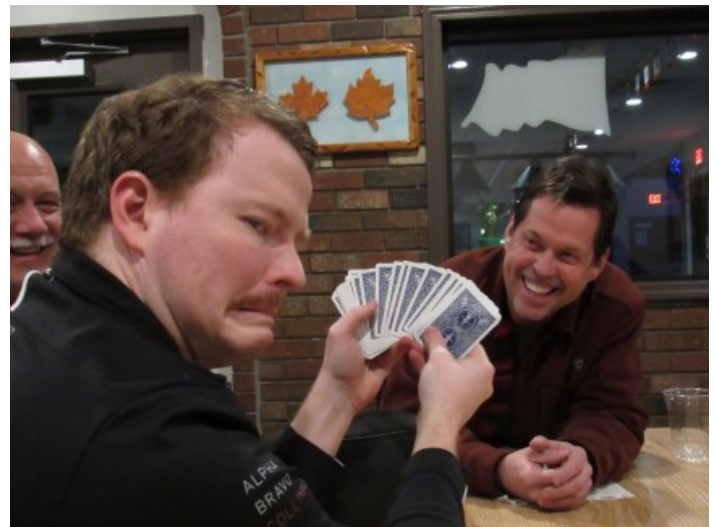
Is this really a good idea??